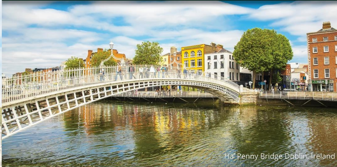
Ha' Penny Bridge Dublin, Ireland

Pre-conference Workshop Wednesday, June 23, 2021 | Thursday, June 24, 2021