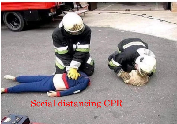
Social distancing CPR