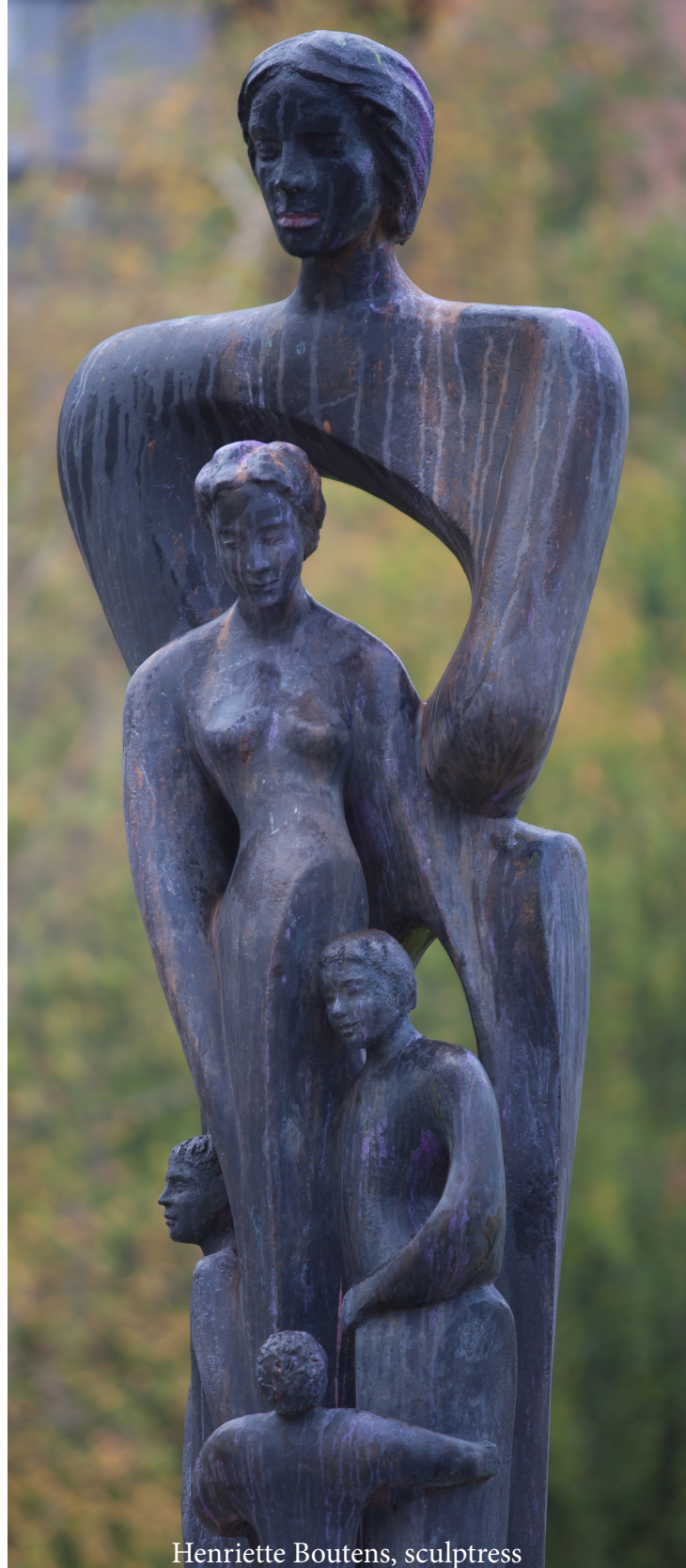
Henriette Boutens, sculptress