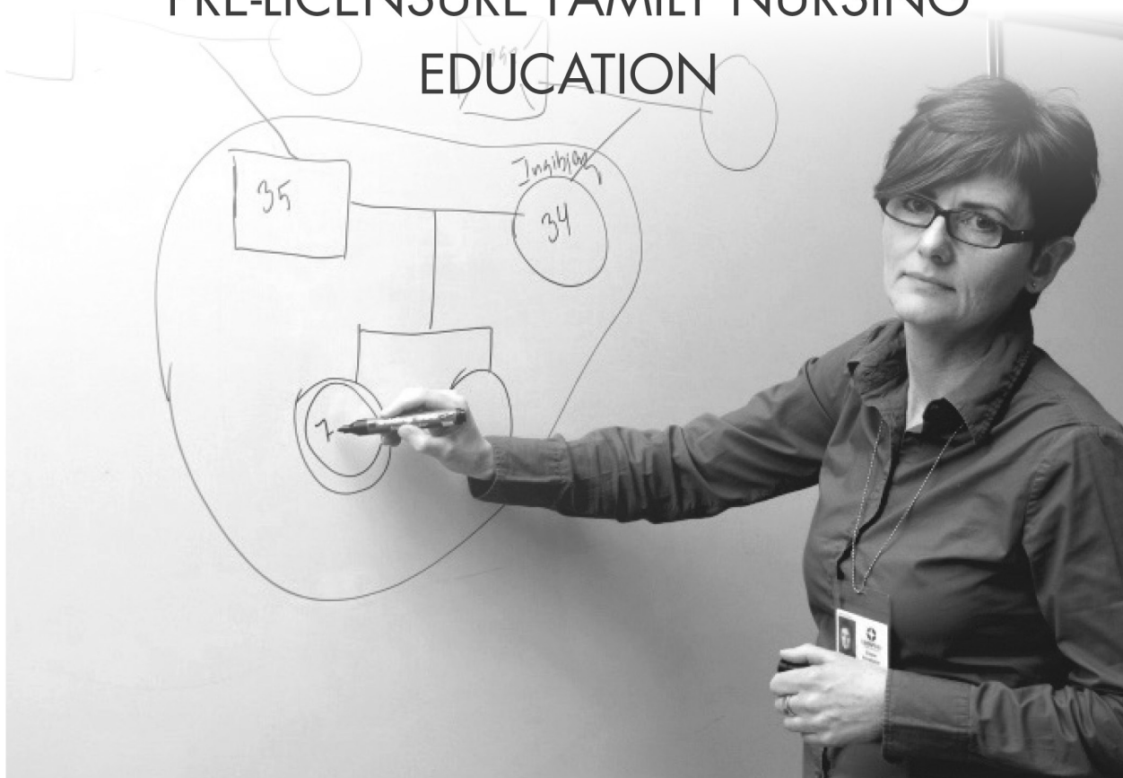
Family Nursing Education in Action: Iceland

Approved by the IFNA Board of Directors on June 13, 2013